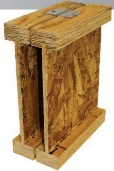
Typical BLIJS installation